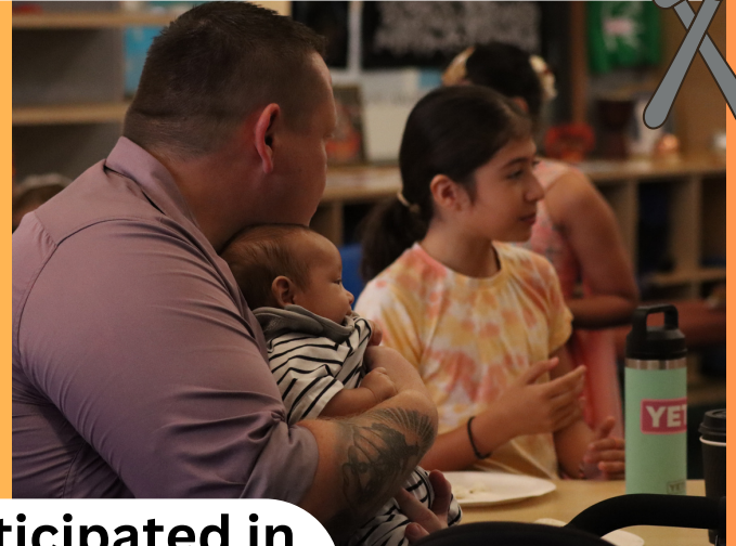
some even participated in cultural activities