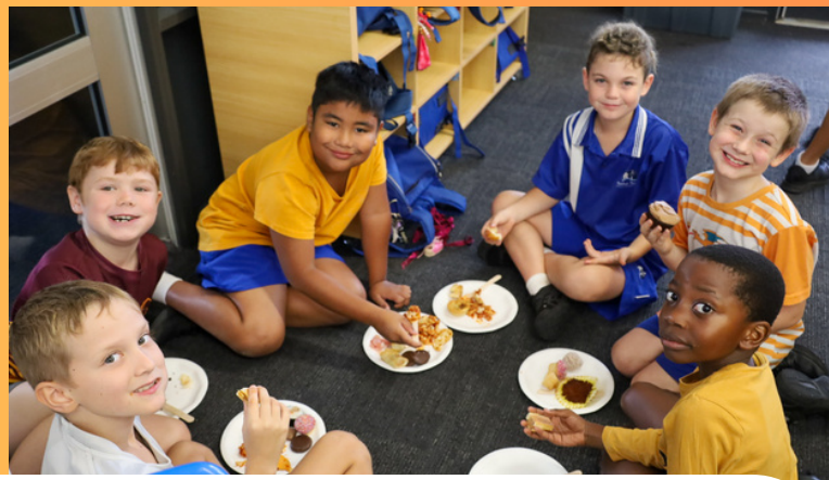
After the parade, students, staff and families gathered to classroom foyers to share some morning tea