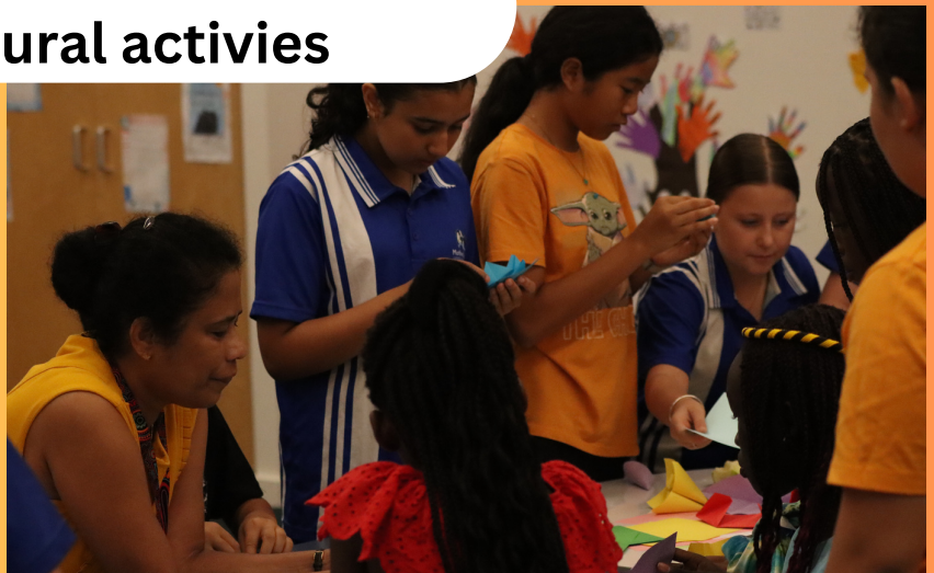
We want to thank everyone for their efforts in making Harmony Day a great one!